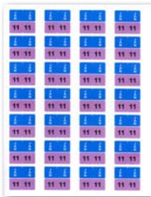
Month / Year